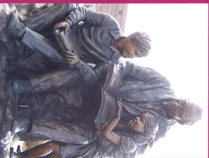
"Legacy of Literature," by Rosalind Cook, Tulsa, OK

Mature adults make a big difference with early elementary children needing extra help in reading.